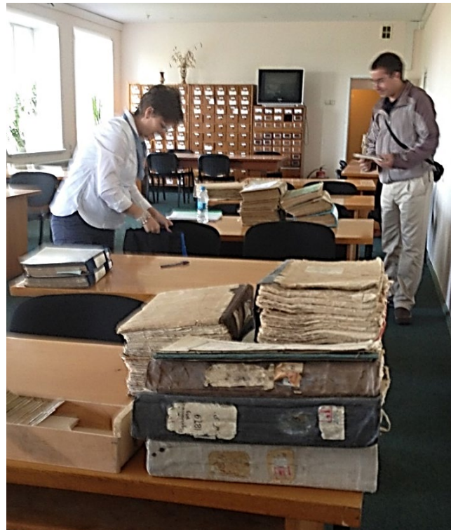
Reading Room in Zhytomir Archives, Ukraine, 2013.

Archivists in the former USSR don't necessarily have the same concept of customer service as we are accustomed to in North America. They may seem impatient or even rude. They do not necessarily mean to be. They are just doing their job of protecting the records and making sure everyone is following the rules.